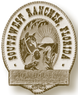
FRONT OF COIN