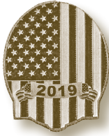
BACK OF COIN

Please support the Scholarship Fund of the Town of Southwest Ranches and purchase your 2019 Southwest Ranches Challenge Coin. They are available at Town Hall, and cost $15.