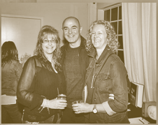
Rolling Oaks Barn